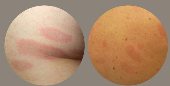
More than one rash